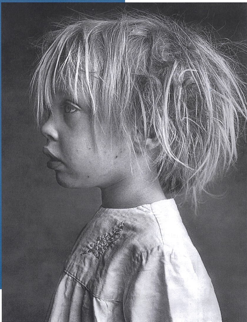
LINDA WOLF, Amande , 1973, giclee from film